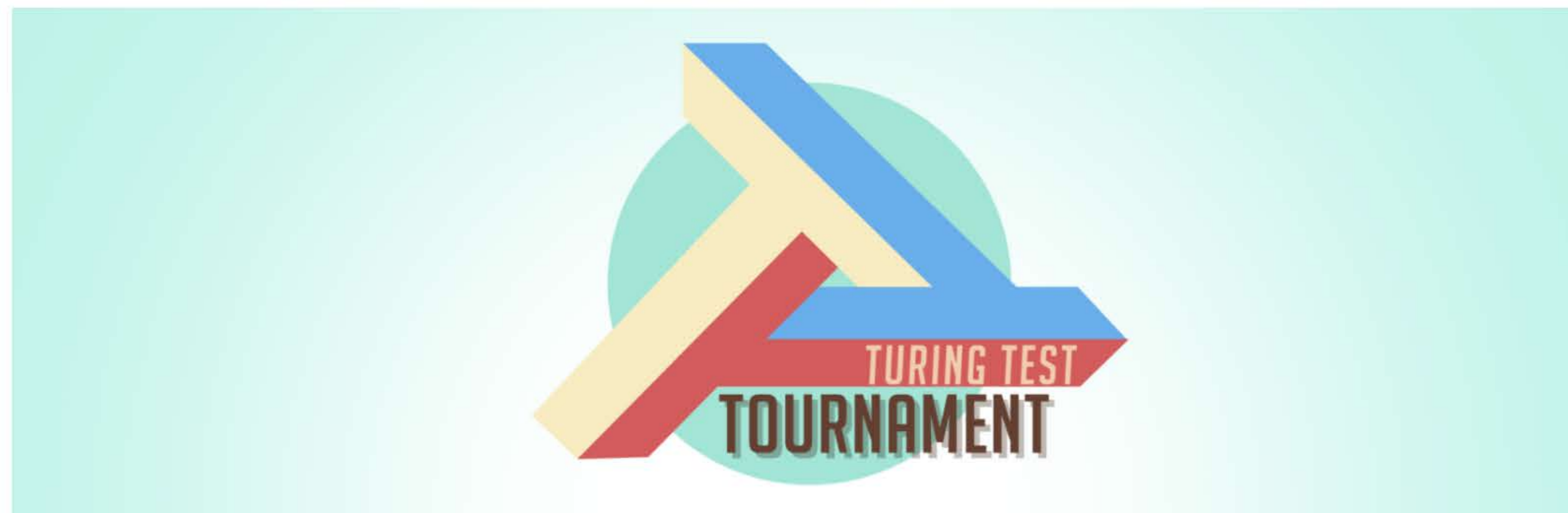
2013 Welcome Video